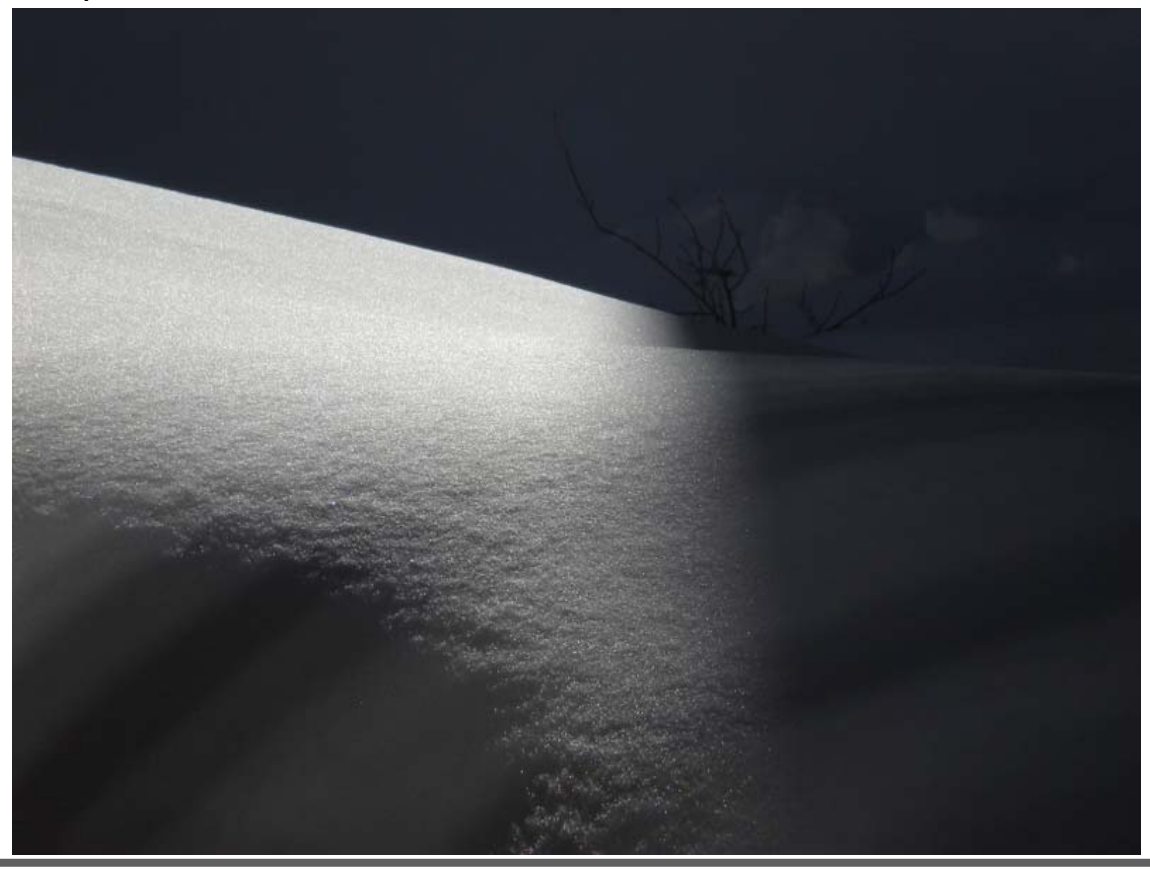
ABOVE: As this issue goes to press, winter lingers in Alta. Photo of "powder shadows" courtesy of Julie Willis.

104 business and property checks 6 motorist assist calls 14 traffic violations 9 alcohol enforcements 3 watershed enforcements 2 vehicle impounds 5 outside agency assists 2 traffic accidents